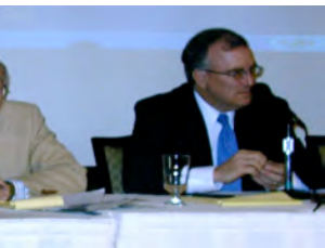
so (left) and th.