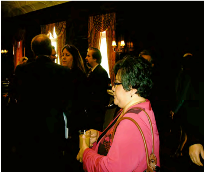
Above and below: Conference attendees enjoying the opportunity to network.